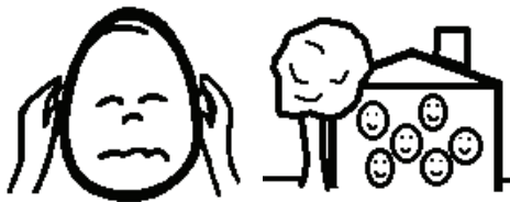
In noisy places